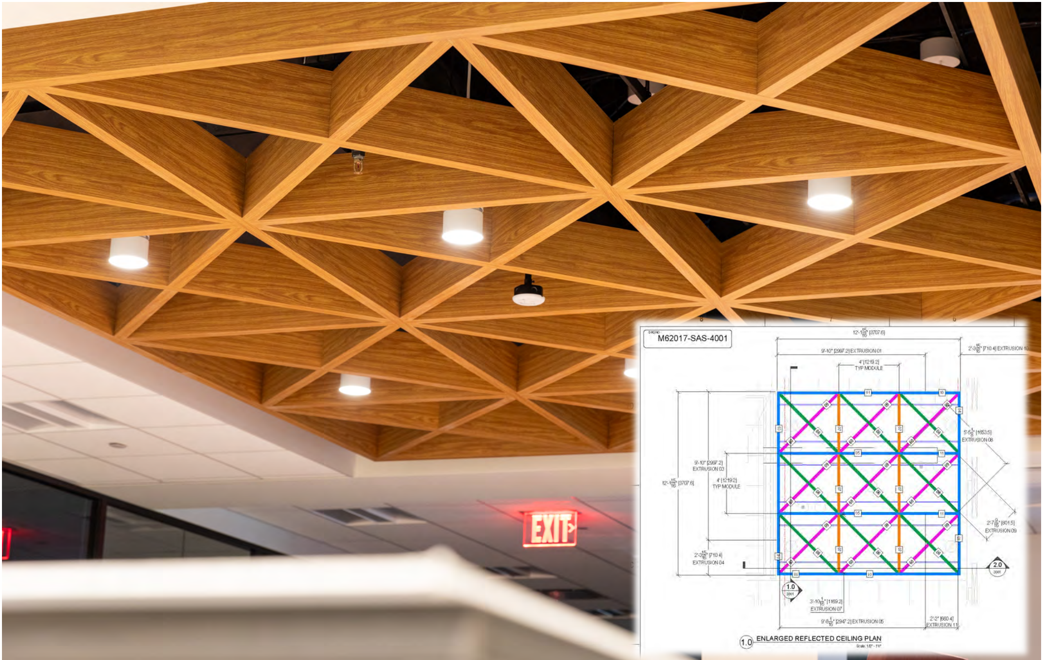
A key benefit of the SAS design was the ability to use mitered ends to efficiently produce the three different geometrical shapes which were specified throughout the project area.