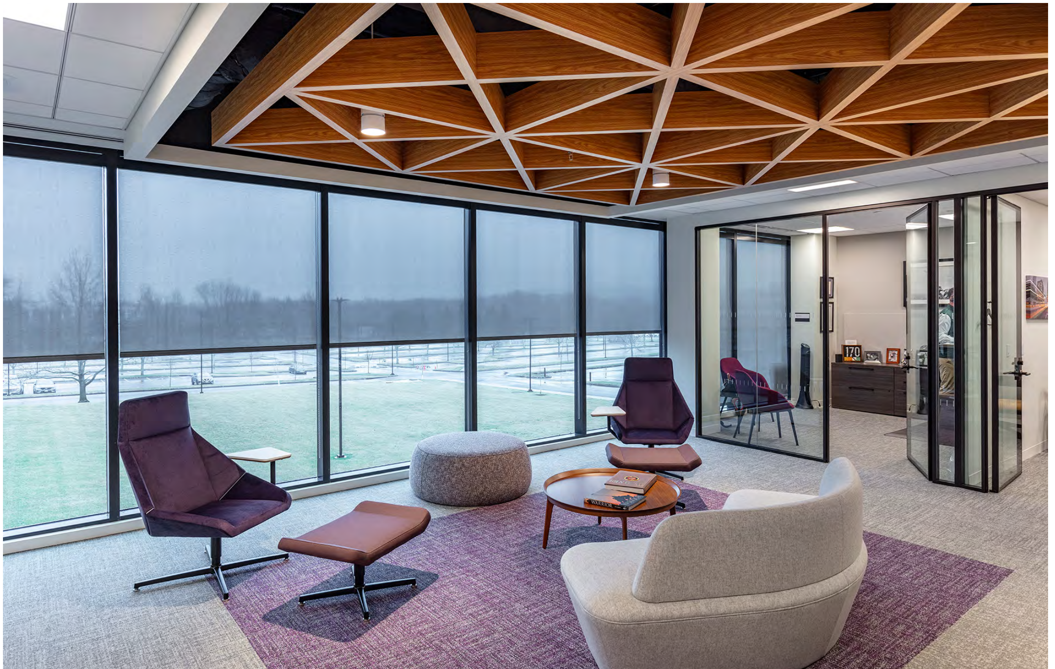
Wood finishes were leveraged throughout the space to pay homage to the wooded suburban environment of the surrounding area.