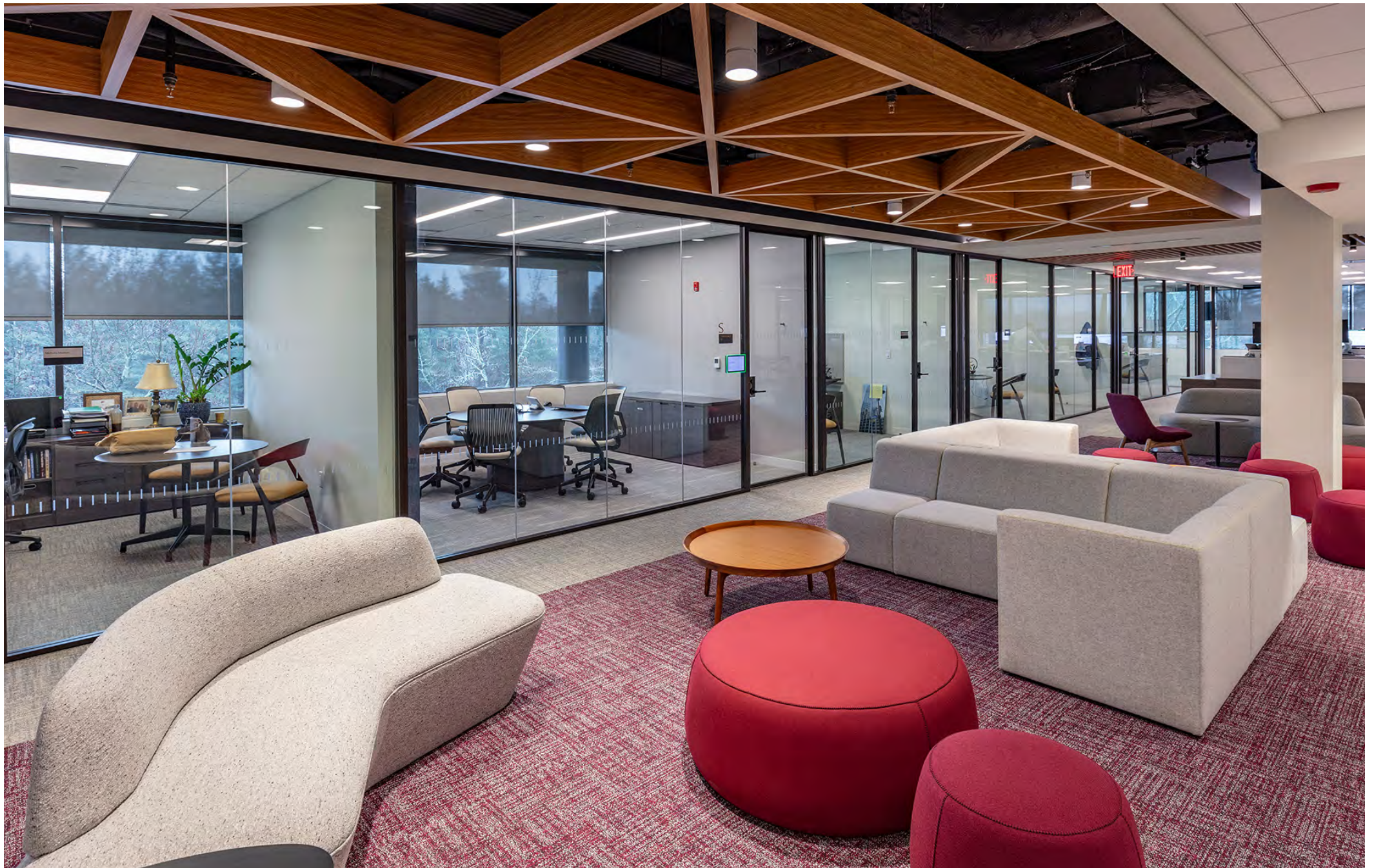
A confidential financial client in Morristown, New Jersey was consolidating several smaller market offices into a large market hub serving as a marquis project for the company.