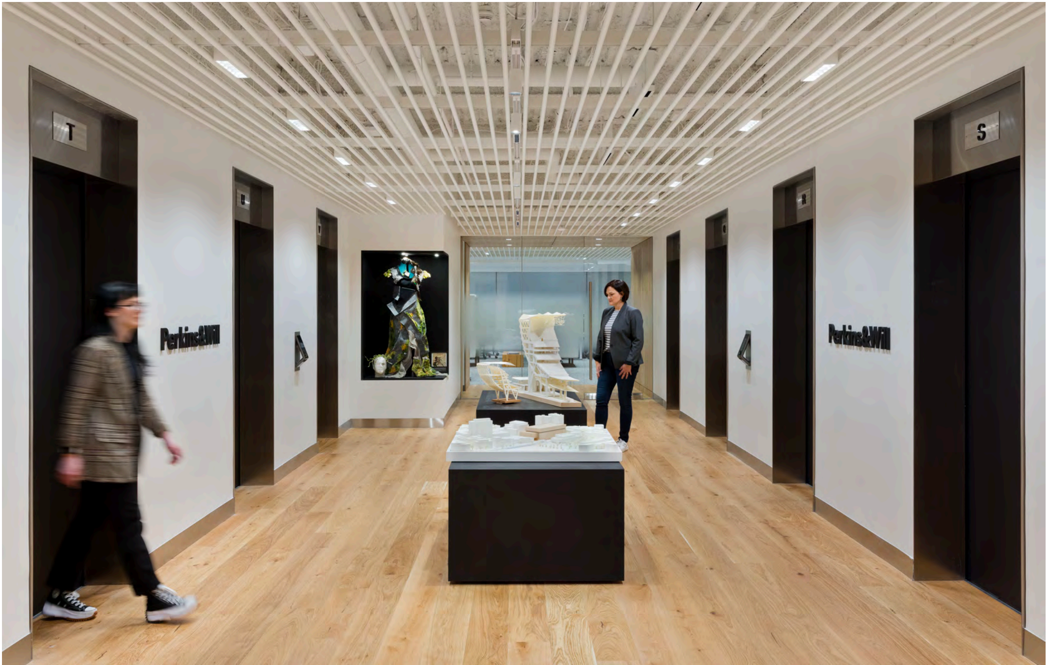
The 7th floor of 225 Franklin Street was transformed into a creative epicenter for the Perkins & Will Boston office. The entire floor plan was designed for collaboration, creating spaces that foster creativity and idea sharing.