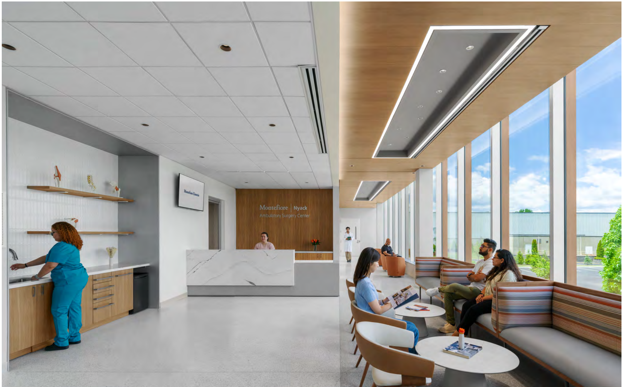
Natural daylight floods the space, complimenting the organic feel of the ceiling providing a bright, welcoming and acoustically sensitive waiting area for patients.