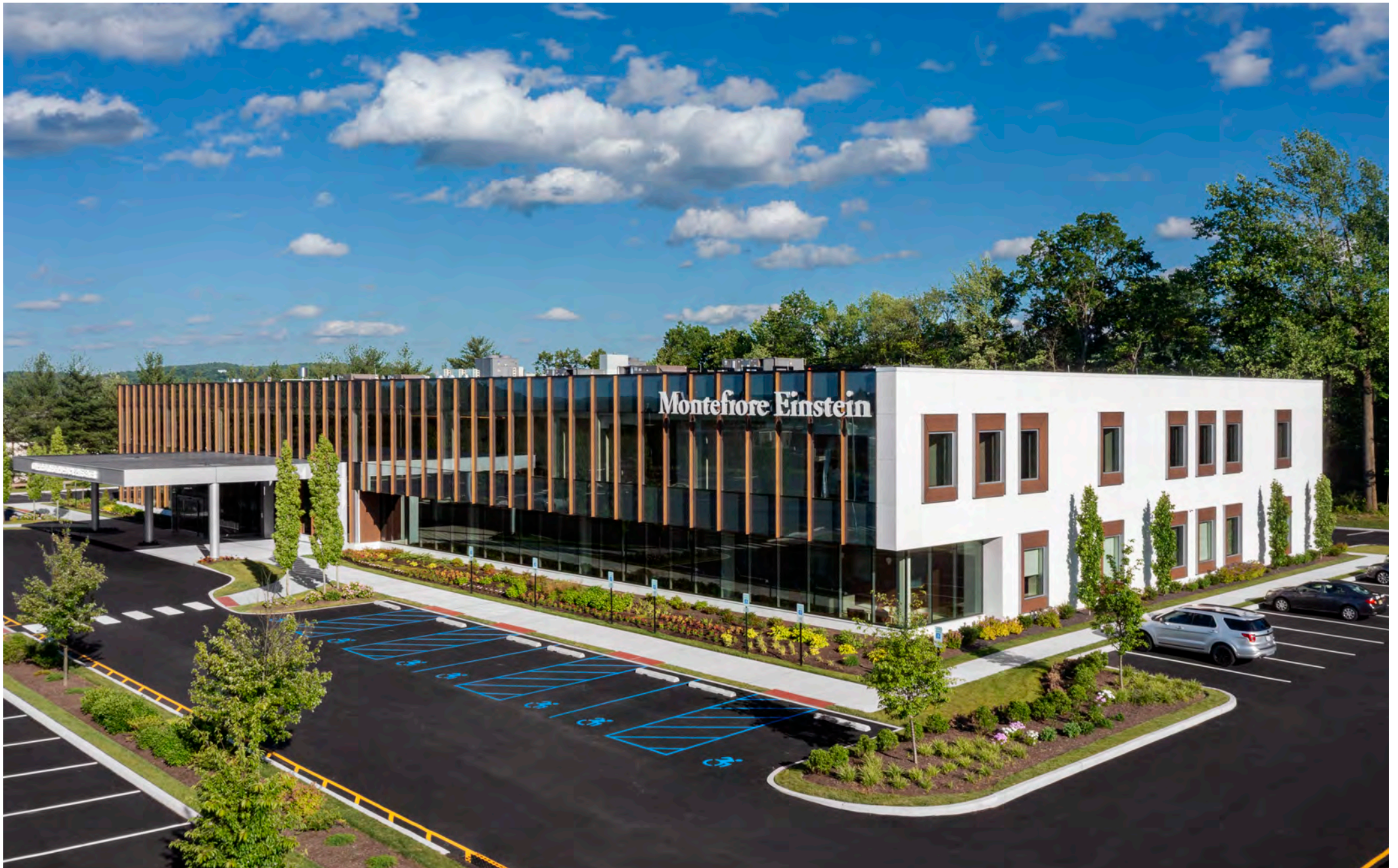
In June 2024 the Montefiore Einstein Comprehensive Orthopedic & Spine Center (M.E.C.O.S.C.) opened a multi-specialty, outpatient facility in West Nyack.