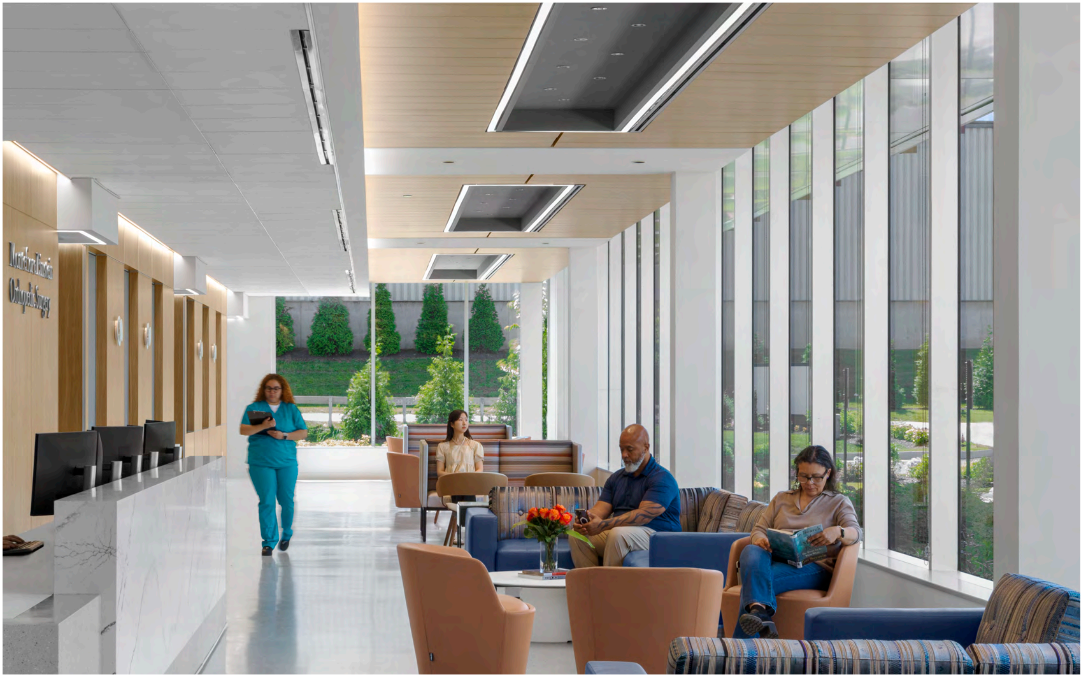
Designed by architects Gensler for Aspect Health Inc, this two-story, 60,000-square-foot building provides a best-in-class ambulatory surgery center, advanced imaging, physical and occupational therapy services along with the supporting cutting-edge medical services.